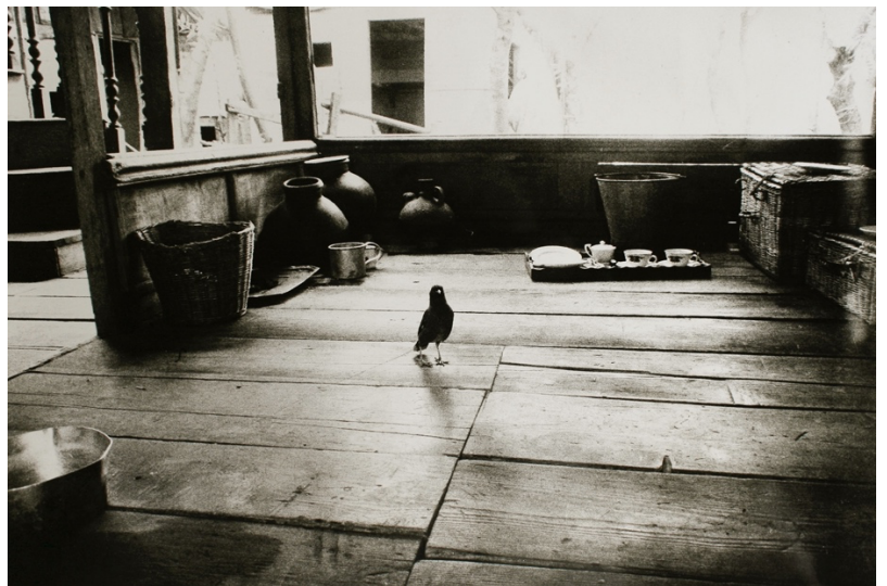
Hitomi Watanabe, "Tenjiku, Kashmir, India (1972), Gelatin silver print, 16.9 × 25.4 cm (image)