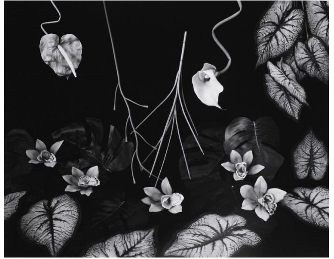
Toshio Shibata, Still life (1988), Gelatin silver print, 19.3 × 24.4 cm