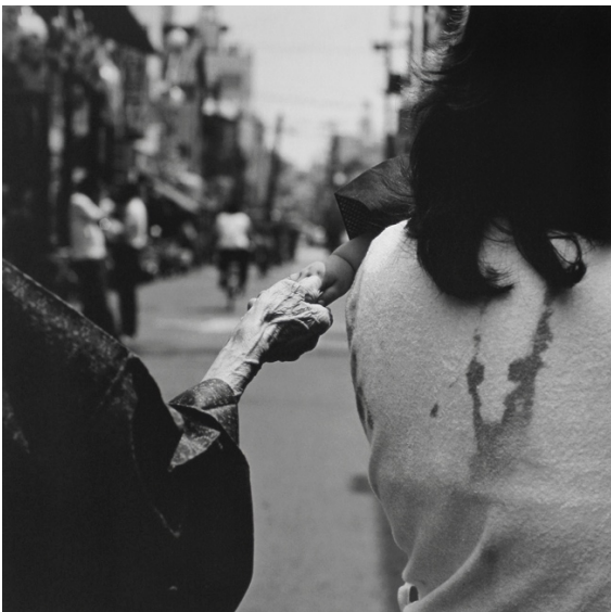
Issei Suda Kojima, Taito-ku, Tokyo from Monogusa Syui (1981), Gelatin silver print, 42.6 × 42.6 cm (image)