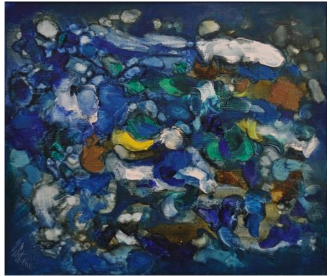
“Color of Gas” 1959, acrylic on canvas, 45.5×37.9cm

Postwar Japanese avant-garde art is currently enjoying a spate of renewed interest in the US and Europe, and the Gutai collective in particular is now being positioned as a leading contemporary Japanese art movement, with a large-scale retrospective entitled “Splendid Playground” to be held at the Guggenheim Museum in New York starting in February.