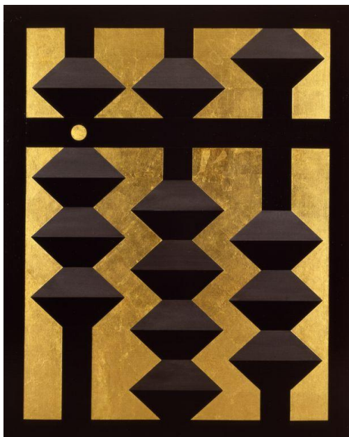
"#588" 1985, acrylic on canvas, 162.1×130.3cm