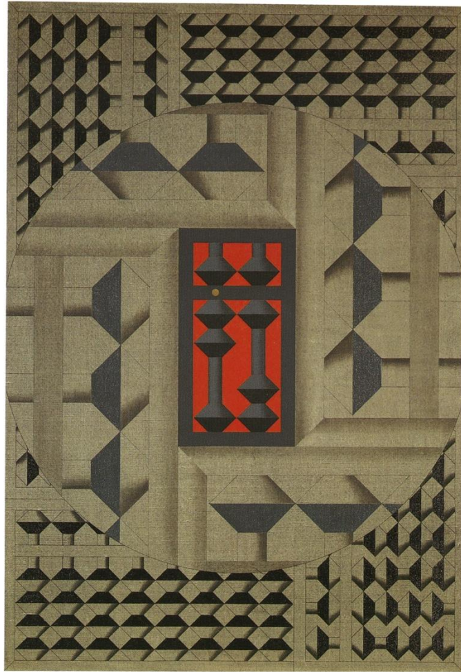
“#422” 1975, acrylic on canvas, 116.7×80.3cm

Exhibition Title: Yoshio Sekine — From Body to Signs