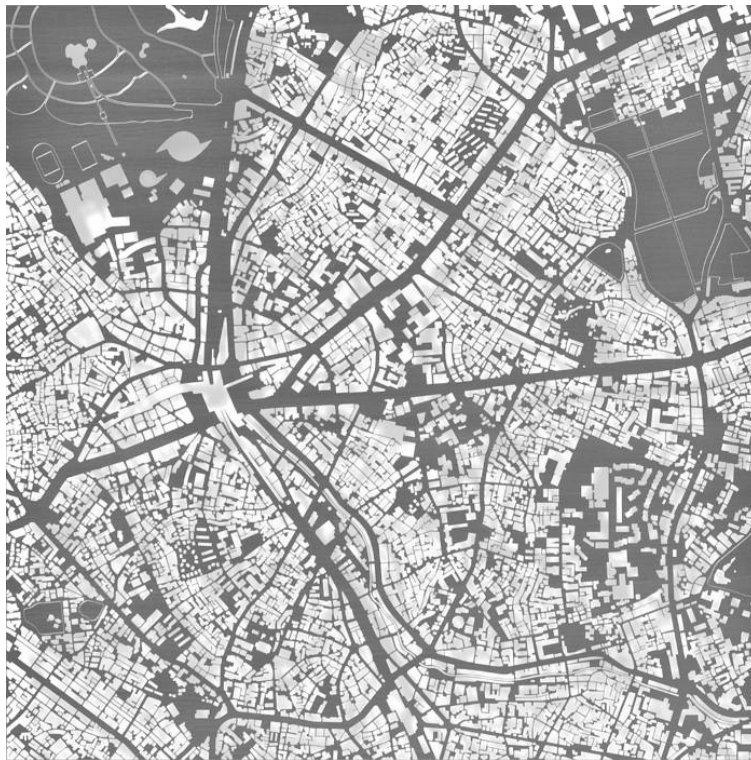
"Tokyo 3x3km series" Etched wood frame, 30 x 30 x 0.03 cm, 2008

Exhibition Title: Trinh&Buscher Solo Exhibition "Universal State of Mind"