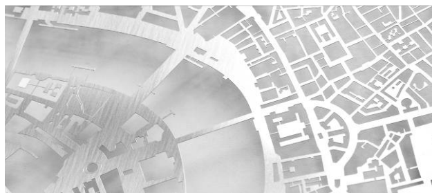
“London 3x3km series” Etched wood frame, 30 x 30 x 0.03 cm, 2008

Trinh & Buscher is an artistic duo comprising Vietnamese-born, Australian-raised artist Chauntelle Trinh and German-born artist Eckard Buscher. After studying design and architecture at university the two founded the collective in 2006. Subsequently, they have been working together on projects that fuse architecture, design and art. In 2011, Trinh & Buscher held a group exhibition entitled “Projection of Site/Sight” with a Japanese artist Shinichi Kaneko at Tokyo Gallery+BTAP in Beijing. The show earned favorable reviews and led the collaborative duo to hold their first solo show in Japan. This exhibition features works from the “Urban Topography Collection” (2008) as well as six most recent works that will be presented for the first time to the public.