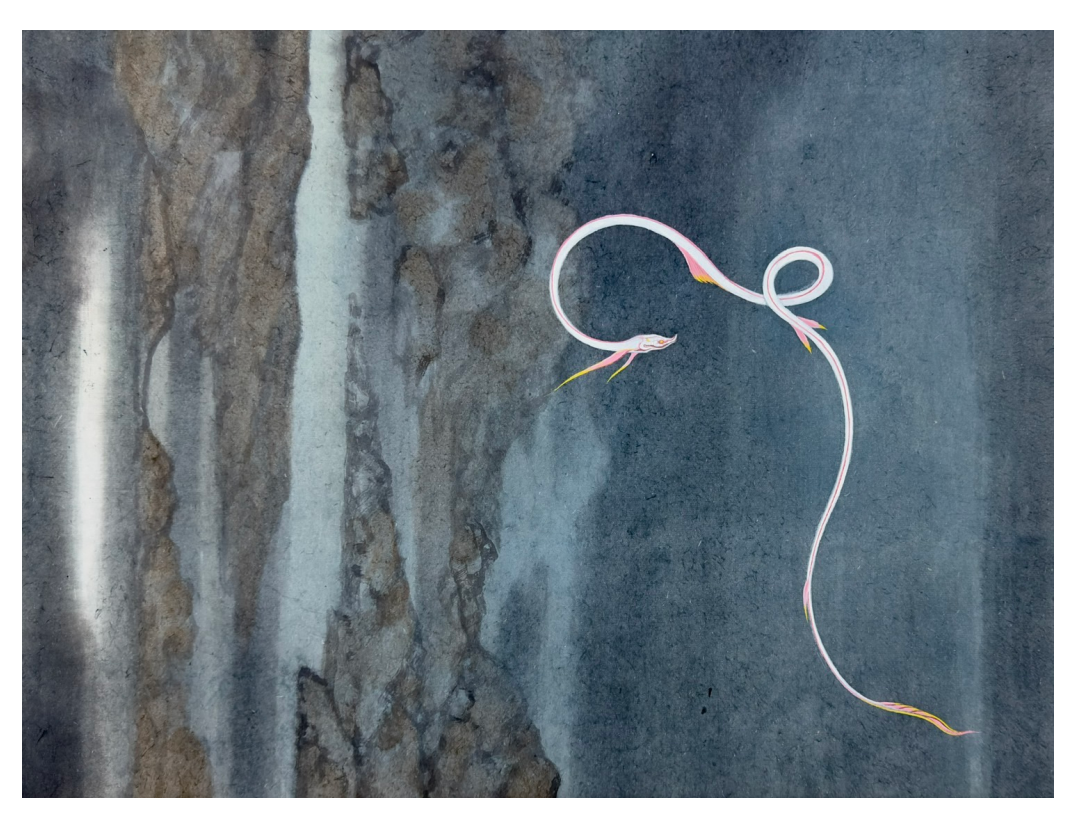
Tulpa 12, 2024, ink and color on paper, 34 \times 46 cm