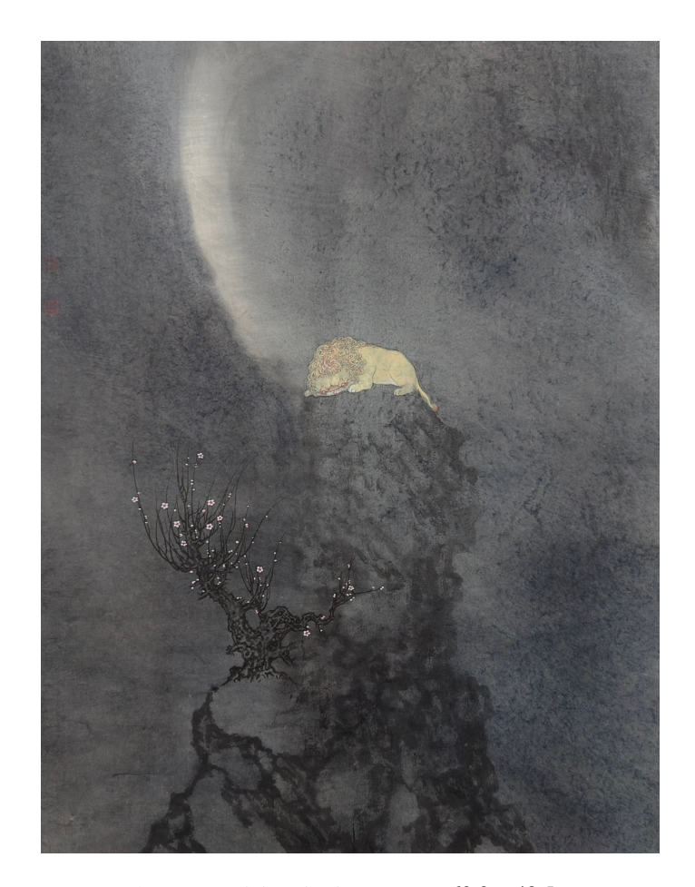
Tulpa 8, 2024, ink and color on paper, 63.2 \times 48.5 cm