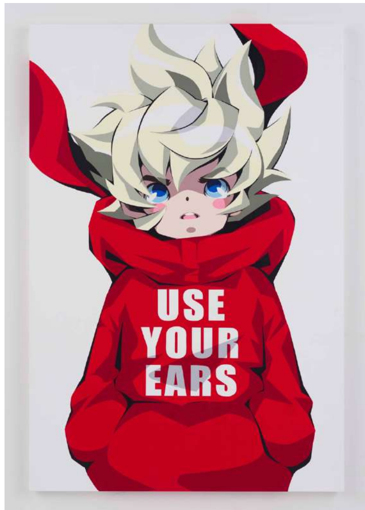
< Windy Bunny 2022 > (2022) Acrylic, canvas, 195 × 130 cm