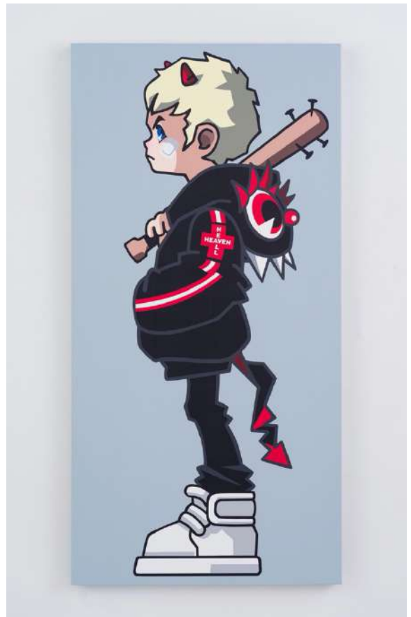
(Upper Left) <'PICTO' Windy Bunny> (2022) Acrylic, canvas, 162 × 81 cm