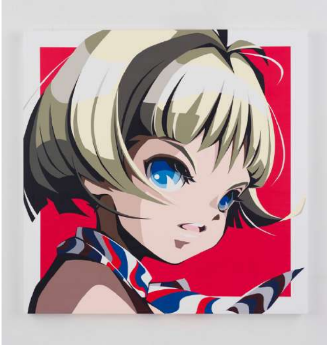
< Girl with Neckerchief > (2022) Acrylic, canvas, 117 × 117 cm