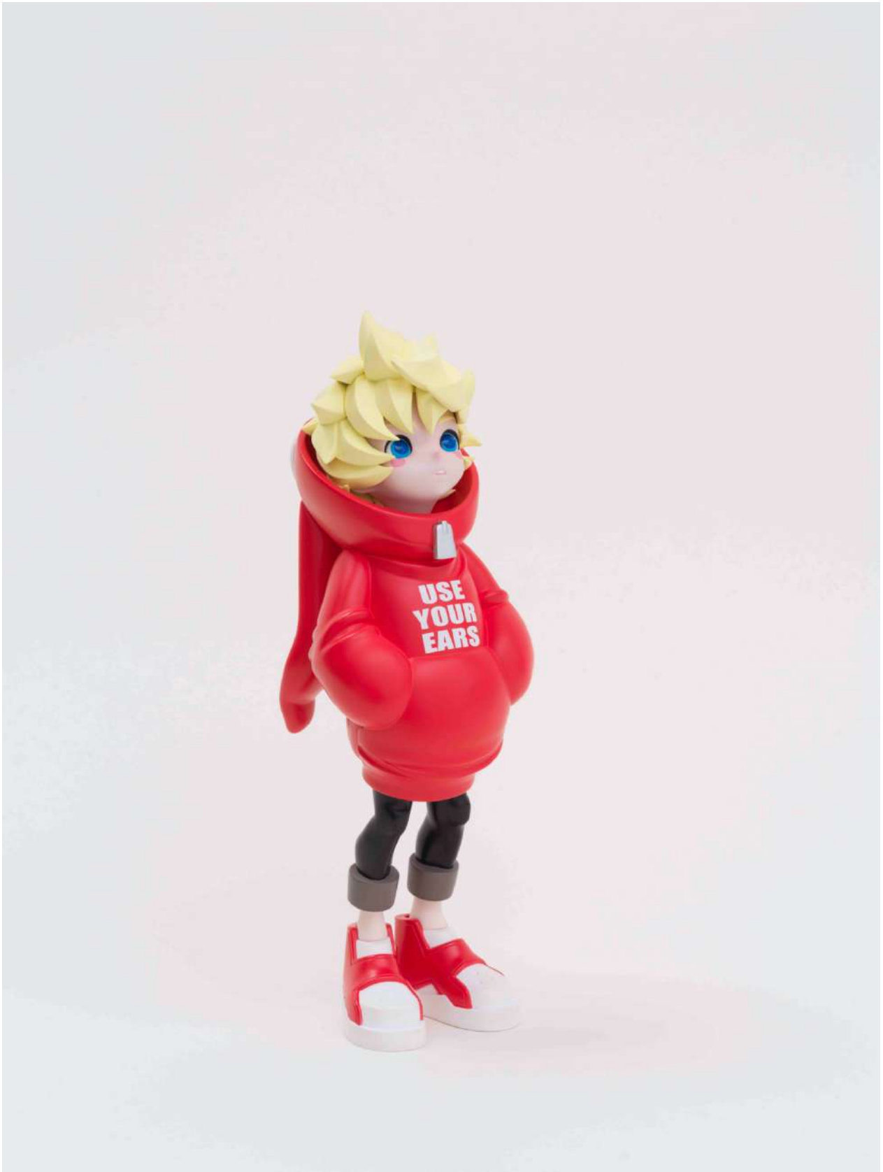
< Windy Bunny 2022 (Figure) > (2022) Synthetic Resin, 25 x 8.1 x 95 cm, Ed.120