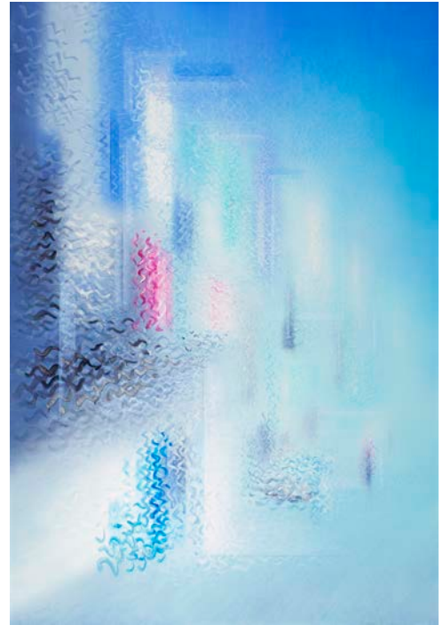
<A Space-Time Nude : Identical (163)> (2023) Oli on canvas, 193.9 × 130.3 cm