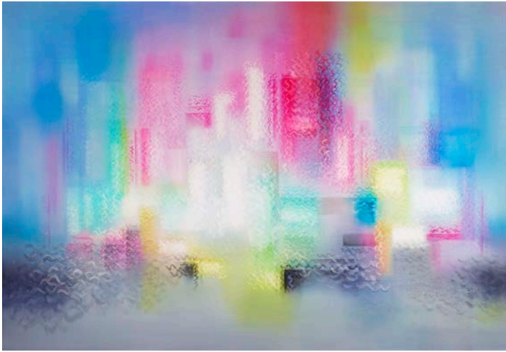
<A Space-Time Nude : Identical (165)> (2023) Oil on canvas, 130.3 × 193.9 cm